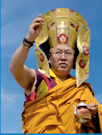
H. H. Drikung Kyabgon Chetsang